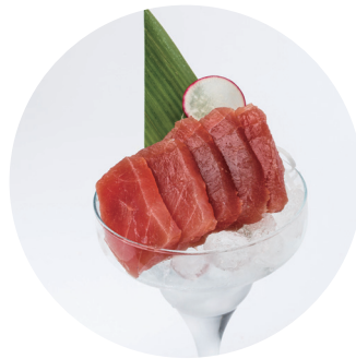
マグロ RED TUNA 7.5