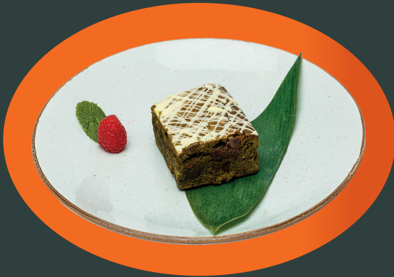
チョコレート抹茶ブラウニー バニラアイス添え Chocolate Matcha Brownie with Vanilla Ice Cream 6.5