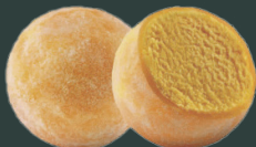
Mango Ice Cream Mochi