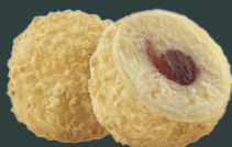
Strawberry Cheesecake Ice Cream Mochi