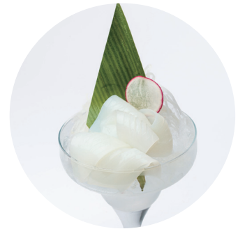
イカ SQUID 6.9

Please let a member of staff know if you have any allergies or dietary requirements and they will be happy to assist you.