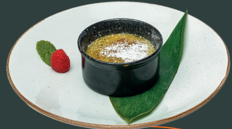
抹茶クリームブリュレ Matcha Crème Brûlée 6.5

Please let a member of staff know if you have any allergies or dietary requirements and they will be happy to assist you.