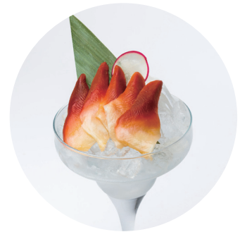
ホッキ貝 SURF CLAM 6.9