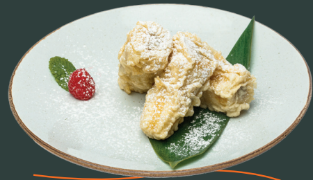
バナナフリッターバニラアイス添え Banana Fritter with Vanilla Ice Cream 6.5