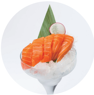
サーモン SALMON 6.9

3 Slices of Red Tuna Sashimi 3 Slices of Salmon Sashimi 3 Slices of Sea Bream Sashimi 12.9