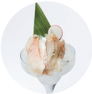
タイ SEA BREAM 6.5