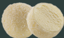
Coconut Ice Cream Mochi