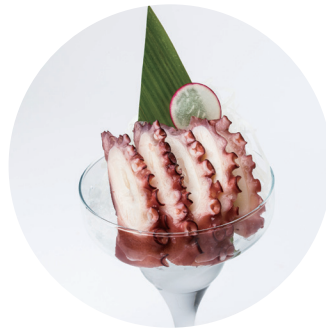
タコ OCTOPUS 6.5