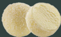
Coconut Ice Cream Mochi