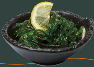
海藻サラダ KAISOU SALAD Seaweed salad full of tangy and explosive flavours. 3.8