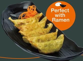
Perfect with Ramen 野菜餃子 VEG GYOZA Pan fried vegetable gyoza delicately balanced flavour. 6.4