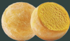
Mango Ice Cream Mochi