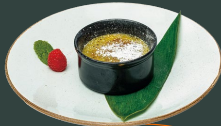
抹茶クリームブリュレ Matcha Crème Brûlée 6.5

Please let a member of staff know if you have any allergies or dietary requirements and they will be happy to assist you.