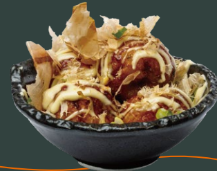
たこ焼き TAKOYAKI Fried Octopus dough balls garnished with homemade sauce and sprinkles of bonito flakes. 6.9