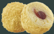
Strawberry Cheesecake Ice Cream Mochi