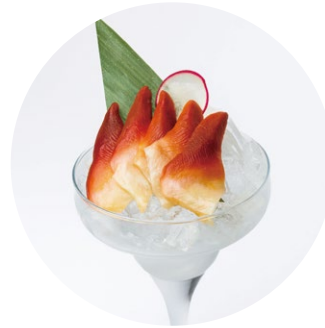
ホッキ貝 SURF CLAM 6.9