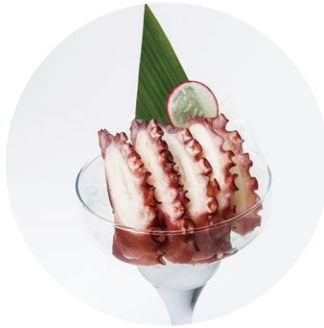
タコ OCTOPUS 6.5