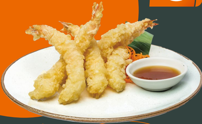
海老天 PRAWN TEMPURA Tempura battered prawns served with homemade dipping sauce. 10.9