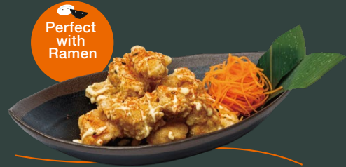
Perfect with Ramen 唐揚げ CHICKEN MAYO KARAAGE Japanese fried chicken served with togarashi mayo. 6.4