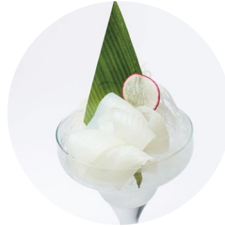
イカ SQUID 6.9

Please let a member of staff know if you have any allergies or dietary requirements and they will be happy to assist you.