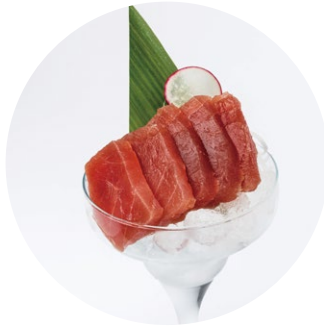
マグロ RED TUNA 7.5