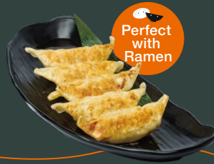
Perfect with Ramen 餃子 CHICKEN GYOZA Pan fried delicious chicken gyoza. Perfect for sharing. 6.4