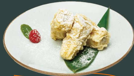
バナナフリッターバニラアイス添え Banana Fritter with Vanilla Ice Cream 6.5