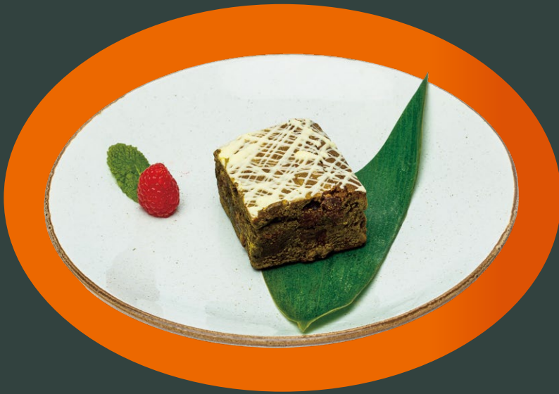
チョコレート抹茶ブラウニー バニラアイス添え Chocolate Matcha Brownie with Vanilla Ice Cream 6.5