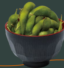
枝豆 EDAMAME Lightly blanched soybeans topped with salt for flavour. 3.9