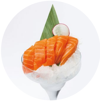
サーモン SALMON 6.9