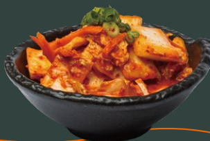
キムチ KIMCHI Spicy and sour fermented cabbage and other veg! The perfect add onto any ramen or sushi. 3.5