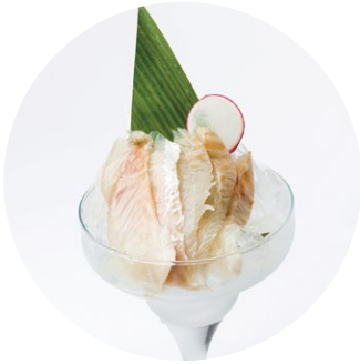
タイ SEA BREAM 6.5